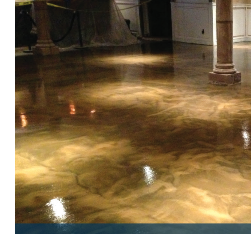
Please check out the color options available on our options for your upcoming project.

The product is a seamless & decorative metallic poured flooring system that utilizes 100% solids technology to create an attractive alternative to stained and polished concrete.